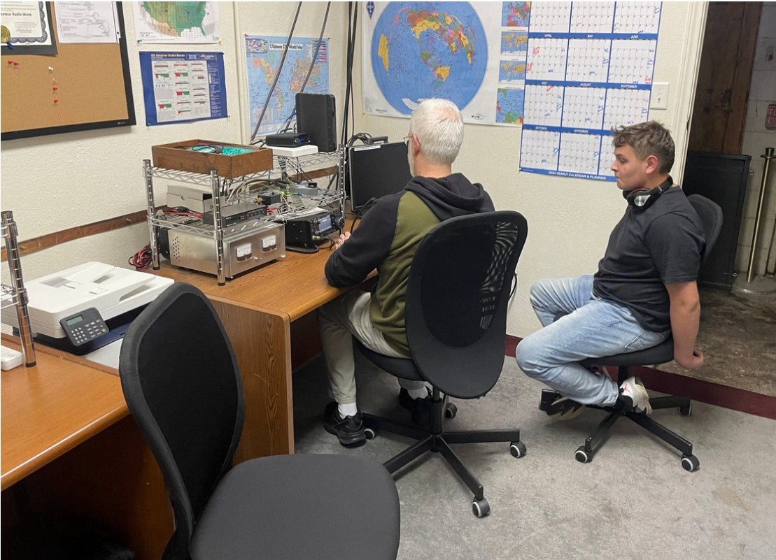
Two club members using the shack during the April open Shack day

Our Club is fortunate to have a fully operational Shack, with excellent radios in the building and a variety of antennas on the roof of the building. The Shack looks and feels much different than it did 6 months ago, due to the hard work of several Club officers and Club members who cleaned up, spruced up, threw away lots of stuff, re-organized and re-wired. It is now a place where IARC Club members can go to get on the air, talk about radio topics and relax with other members. On Sunday afternoon, April 21, our Club held another "Open Shack Day". Eight of our current and future members met that day to fire up the ICOM 7300, work some QSOs and talk to each other about technical topics. It was a fun afternoon. Please be sure to attend one of the Open Shack Days in the near future - you will enjoy the facilities, the radios, the antennas and the fellowship. Our IARC Shack is now in top shape, and everything works. Let's take full advantage of it!