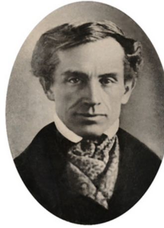
Samuel Finley Breeze Morse 1791-1872